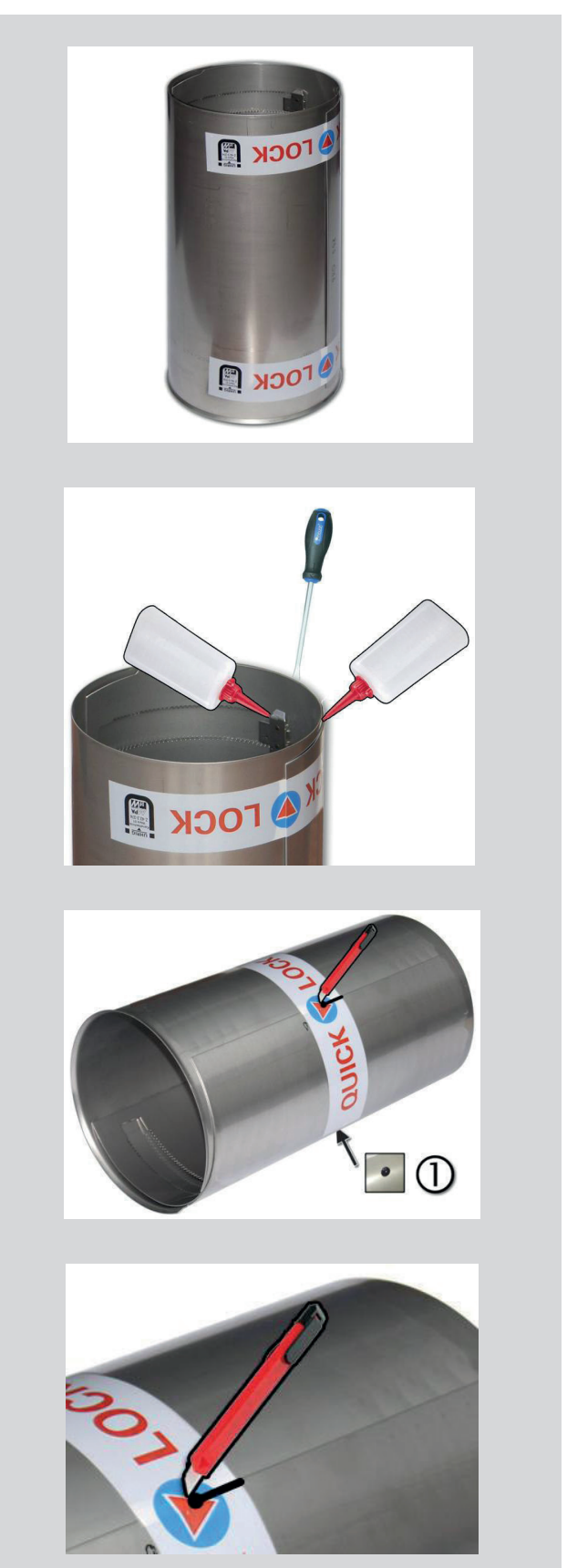
Cut the adhesive tape half-way through